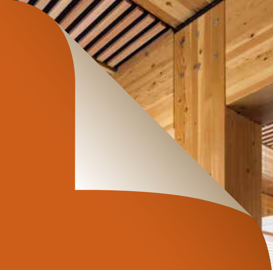
IMAGE [ WOOD INNOVATION AND DESIGN CENTRE [ MG-ARCHITECTURE

A two-year, extensive, consultative approach drove the Proposal for Change and it continues with a communications program that is designed to encourage its uptake – with economic benefits for industry.